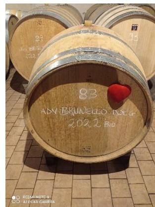
(Cantina Prime Donne)